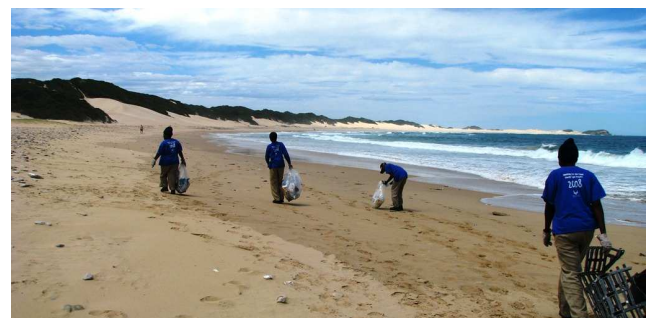
Working for the Coast team cleaning up the beach

Not only does this provide jobs, but protects our coastal and marine resources and improves tourism too. Everyone likes a clean and safe beach.