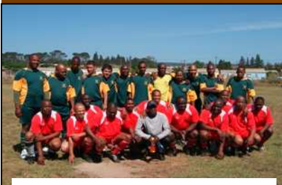
Addo Mighty Elephant Team in green