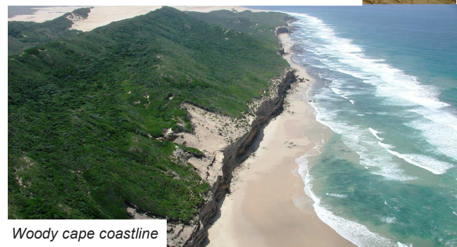
Woody cape coastline